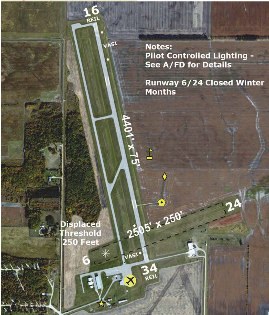
Roseau Municipal Airport - Rudy Billberg Field

SEC. CH: TWIN CITIES LAT: 48-51-21.737N LONG: 095-41-49.339W Approaches: VOR RNAV Calm Wind Rwy 16 COMM: 122.8 (L) WX: VOR 108.8 CTR: 134.75 MSP RCO FSS: 122.25