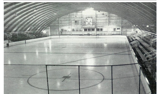
Memorial Arena—Circa 1960

improvements and keep Memorial Arena preserved and operable for future generations of Minnesotans to appreciate.