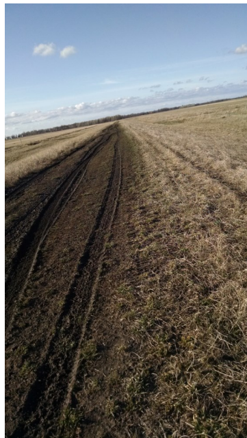
Top of East Diversion Levee damaged by ATV and vehicle traffic

Additionally, the costs to repair the damages already done will be significant. The City is in the process of creating signage to post at the current locations where ATV and motorized vehicle usage of levee tops is particularly heavy to educate riders that these "unauthorized routes" are closed to any motorized traffic.