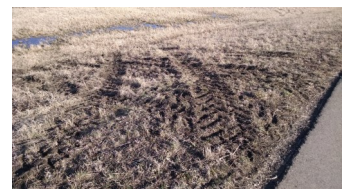
Ruts in East Diversion Levee left by a tractor driving across levee

City Offices will be closed for Independence Day (July 4) and Labor Day (Sept 5)