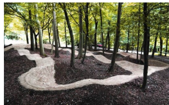
Example of a Pump Track Feature

The City of Roseau has been working with a group of local bike enthusiasts to develop a single track mountain bike trail within the confines of the Roseau East Diversion Project. What is single track? Basically it's a narrow mountain bike trail about the width of a bike. It can be smooth, rocky, or be man made and ridden by all ages and all skill levels. The majority of the single track is proposed for areas of the Di-