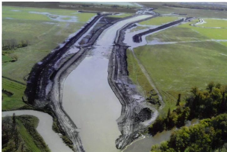
Aerial Photo of the northern reach of the Roseau Flood Control Diversion Project. The U.S. Army Corps of Engineers recently opened bids on an additional construction contract for .38 miles of diversion channel construction for $2.5 million. The apparent low bidder was Gladen Construction of Bemidji. Construction on this reach is anticipated to begin in the spring of 2014.

In the event that the original House language prevails, or that Congress does not pass a conference bill at all, the City has a "Plan B" to seek permission from the Corps of Engineers to complete the project using local sponsor funds from the State and City.